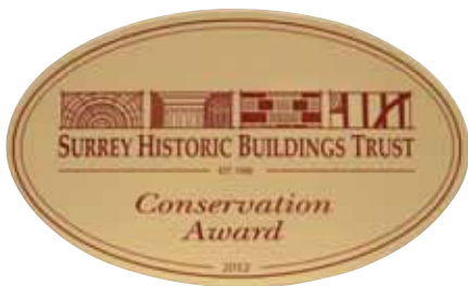
SCREEN PRINT - The choice of colour and lettering can create effects more often associated with expensive materials and methods.