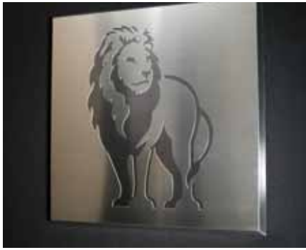
STAINLESS STEEL - A refreshing use of a modern image on a long established material.