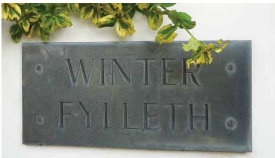
STATELY - The use of a time-honoured natural stone such as slate creates a distinguished looking durable sign.